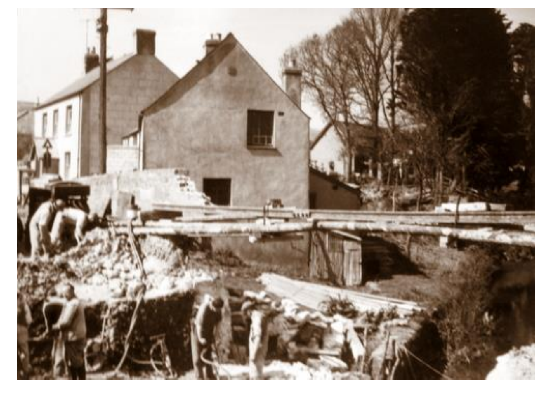
New Bridge in course of construction