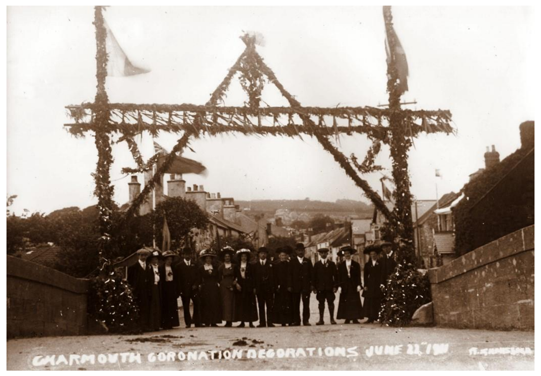
A group of smartly dressed villagers line up under one of the decorated Arches celebrating the Coronation of King George V.