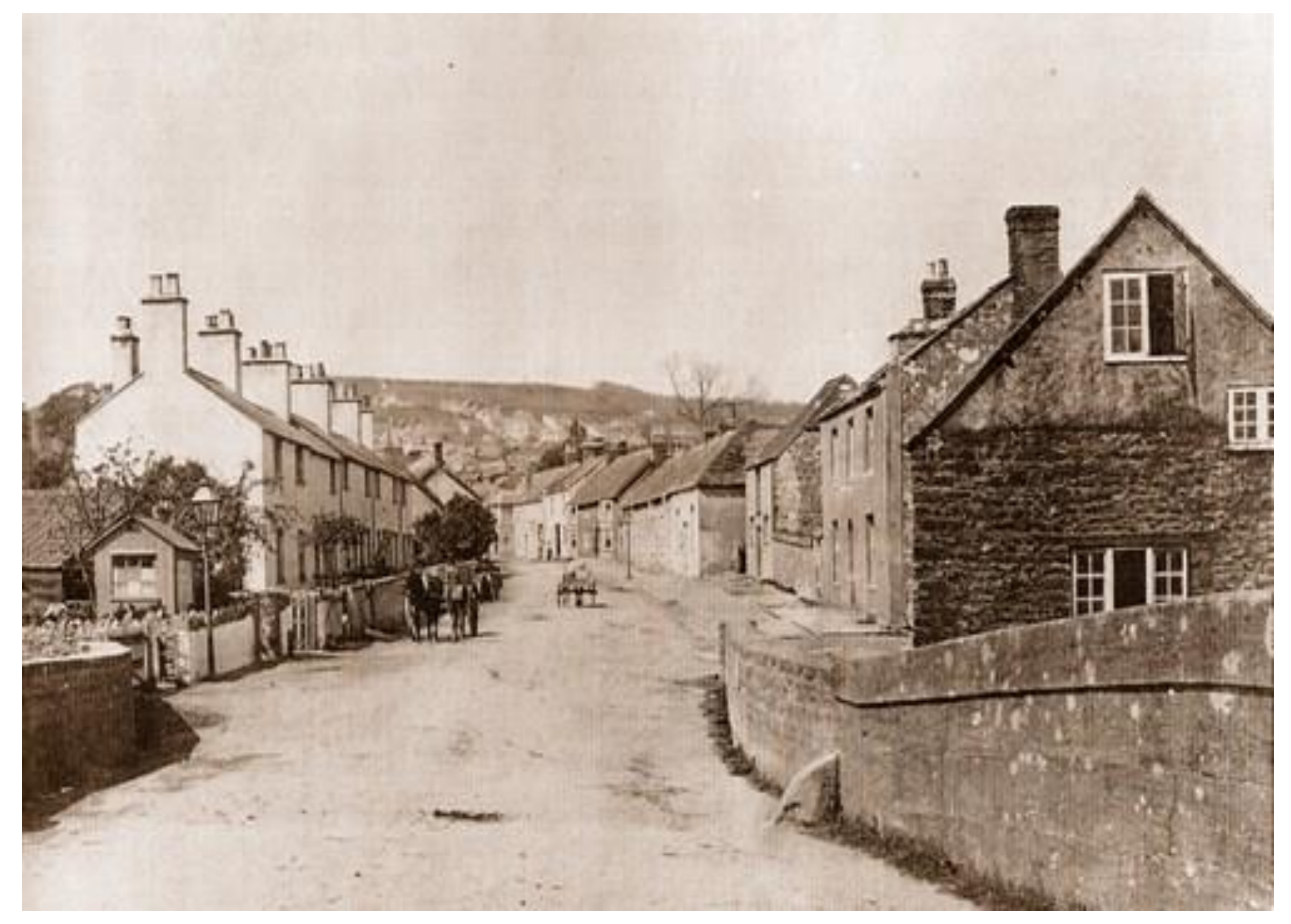
View from Bridge in 1890 showing Drill Hall before Gable added