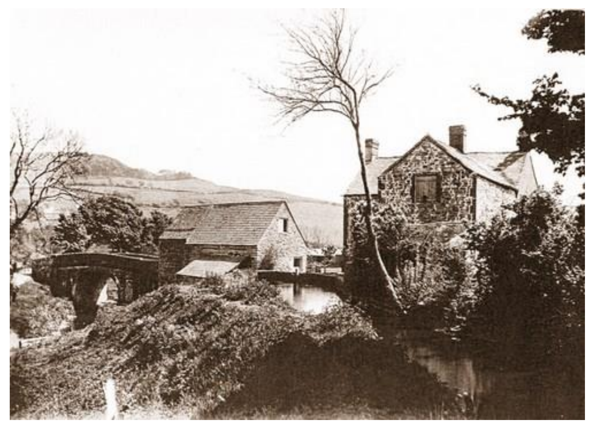
View in 1900 looking from Manor Farm