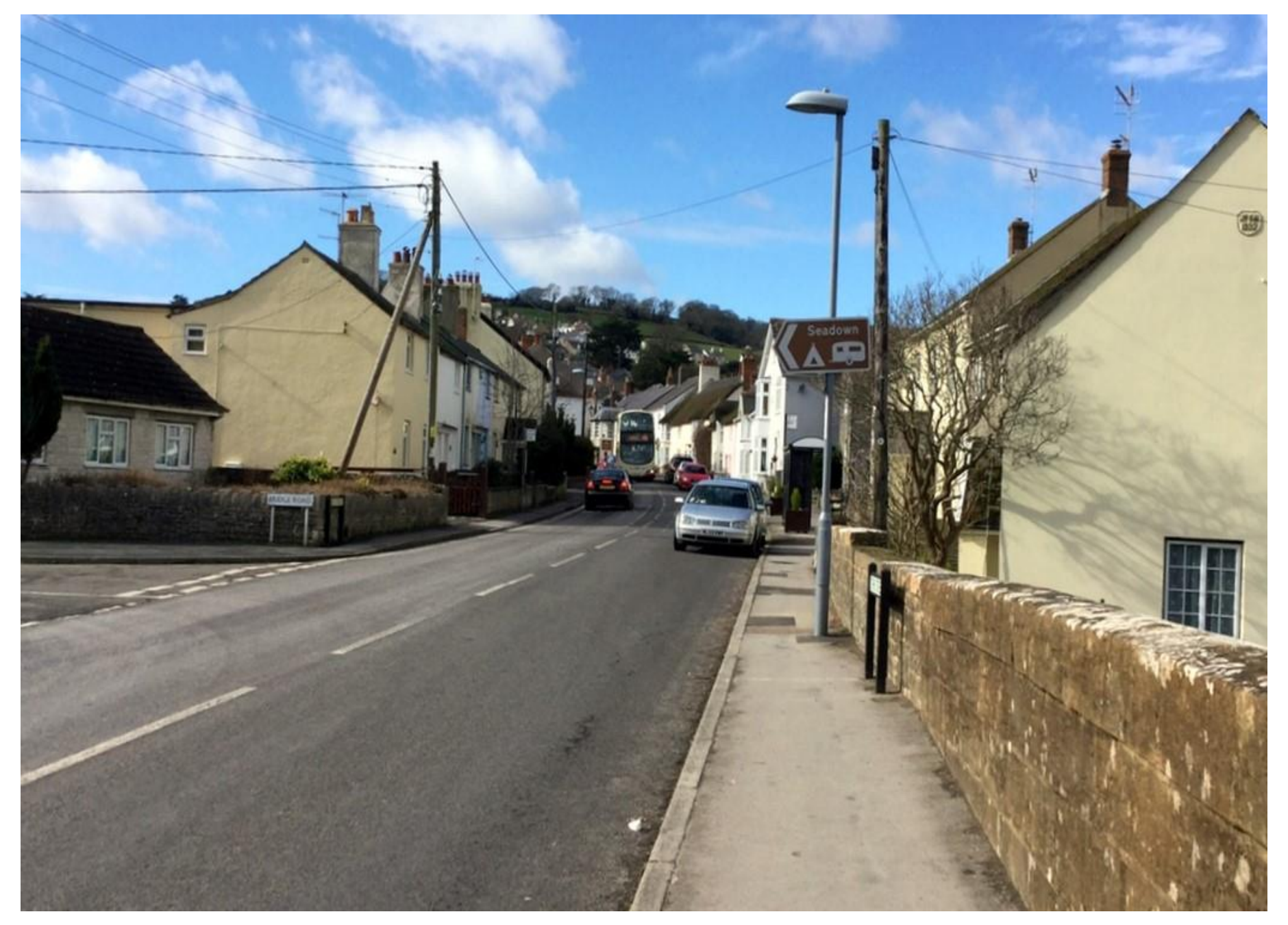
The same view today