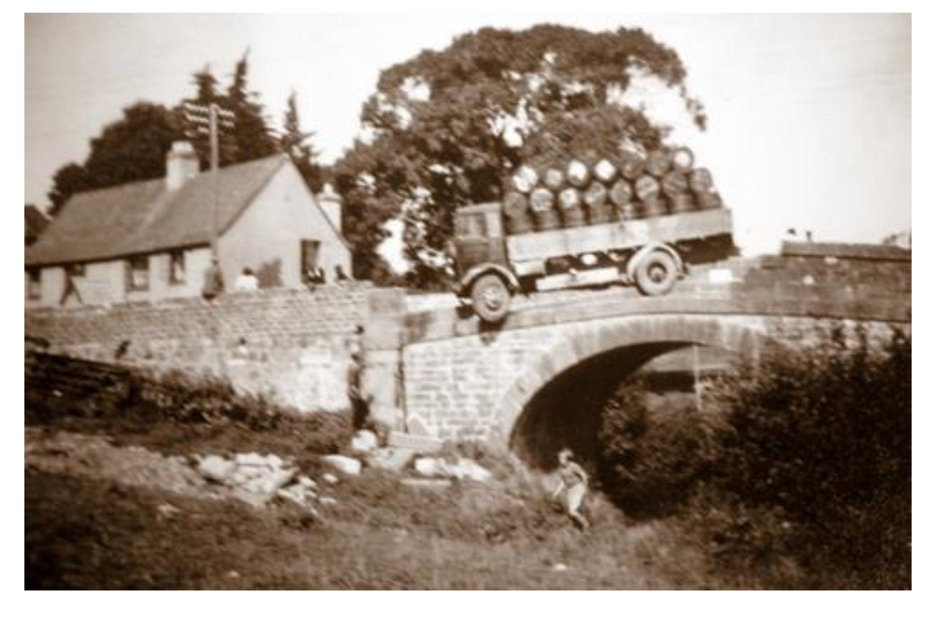
Lorry going over Bridge in 1937