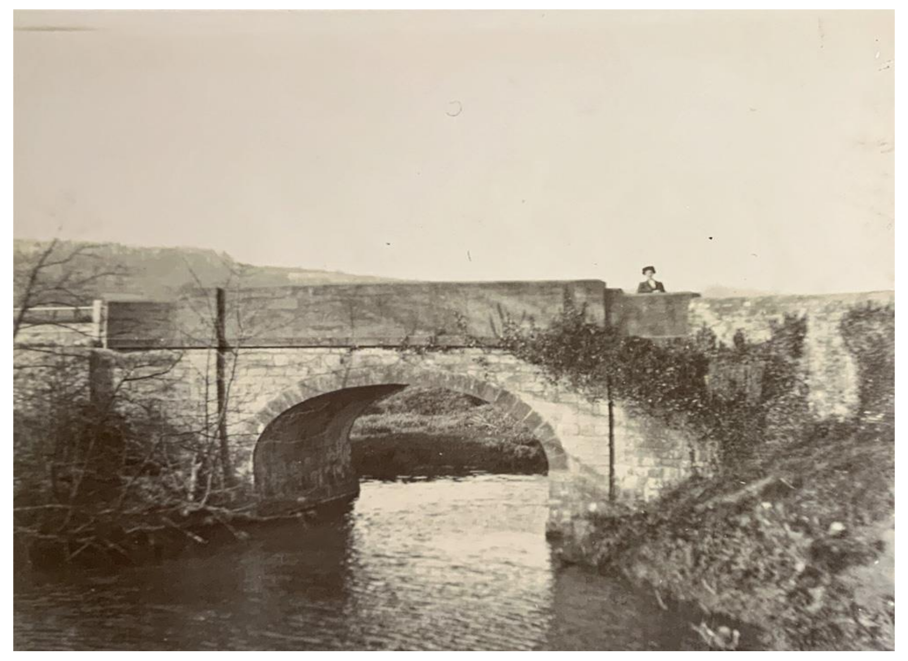
Charmouth Bridge c.1900